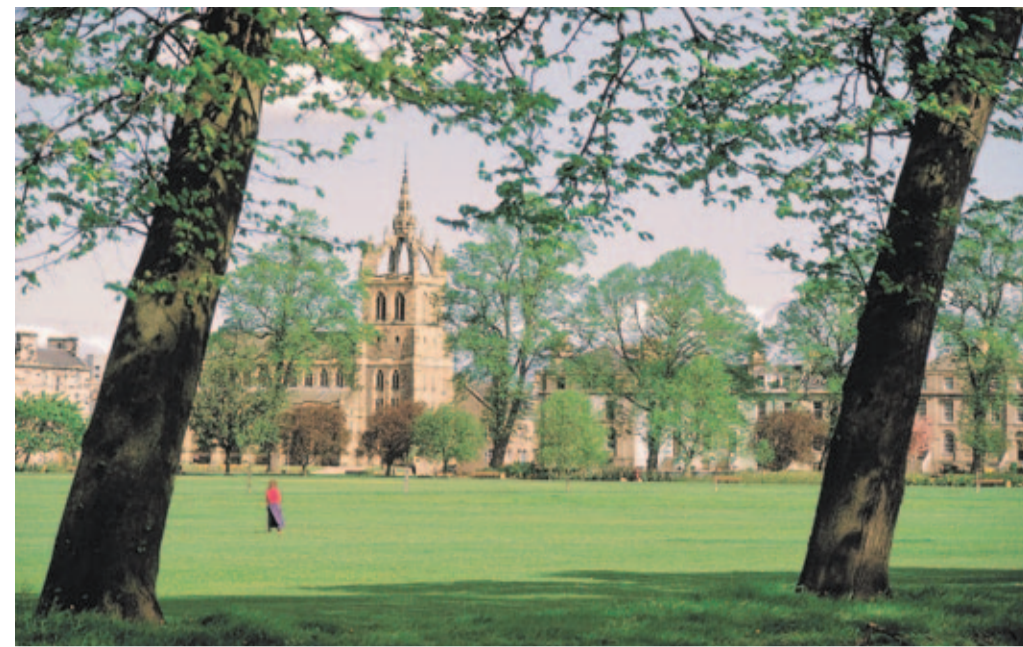
STREETS APART Above, the Church of St. Leonard's in the fields at Perth, below, which was once the medieval capital of Scotland

In the contemporary and chic surroundings I went native for my starter, enjoying Loch Tarbert mackerel tartare, boiled quail's egg and escabeche dressing.