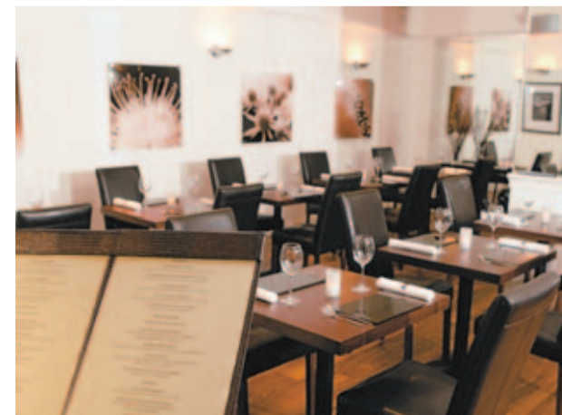
SUPERB FOOD The Opus One main dining area