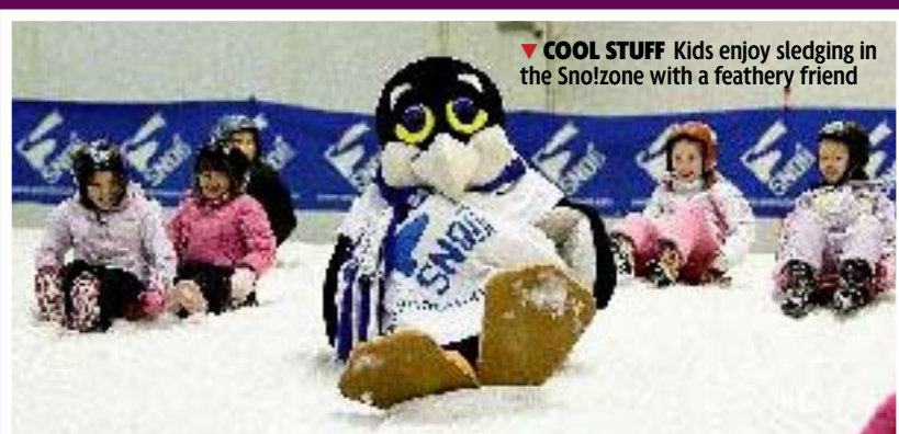
▼ COOL STUFF Kids enjoy sledging in the Sno!zone with a feathery friend

If you need to escape, Xscape is as good a place as any.