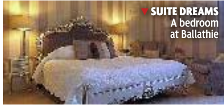
▼ SUITE DREAMS A bedroom at Ballathie