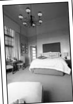
COMFORT: Luxury rooms

Elsewhere, there is the Lazels restaurant for lunch or a coffee break, or the lounge, with daily papers, afternoon tea, and pre-dinner cocktails.