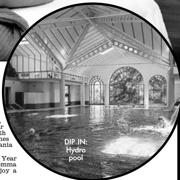
DIP IN: Hydro pool

Hotel hol's a splash hit for all the family