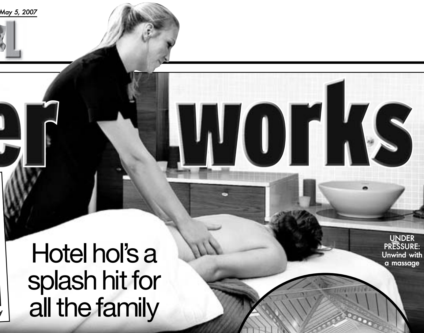
UNDER PRESSURE: Unwind with a massage